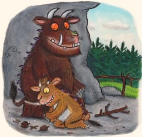
The Gruffalos stayed in the Gruffalo cave. The Gruffalo's Child did her best to behave.