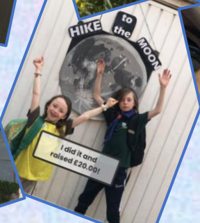
I did it and raised £20.00!